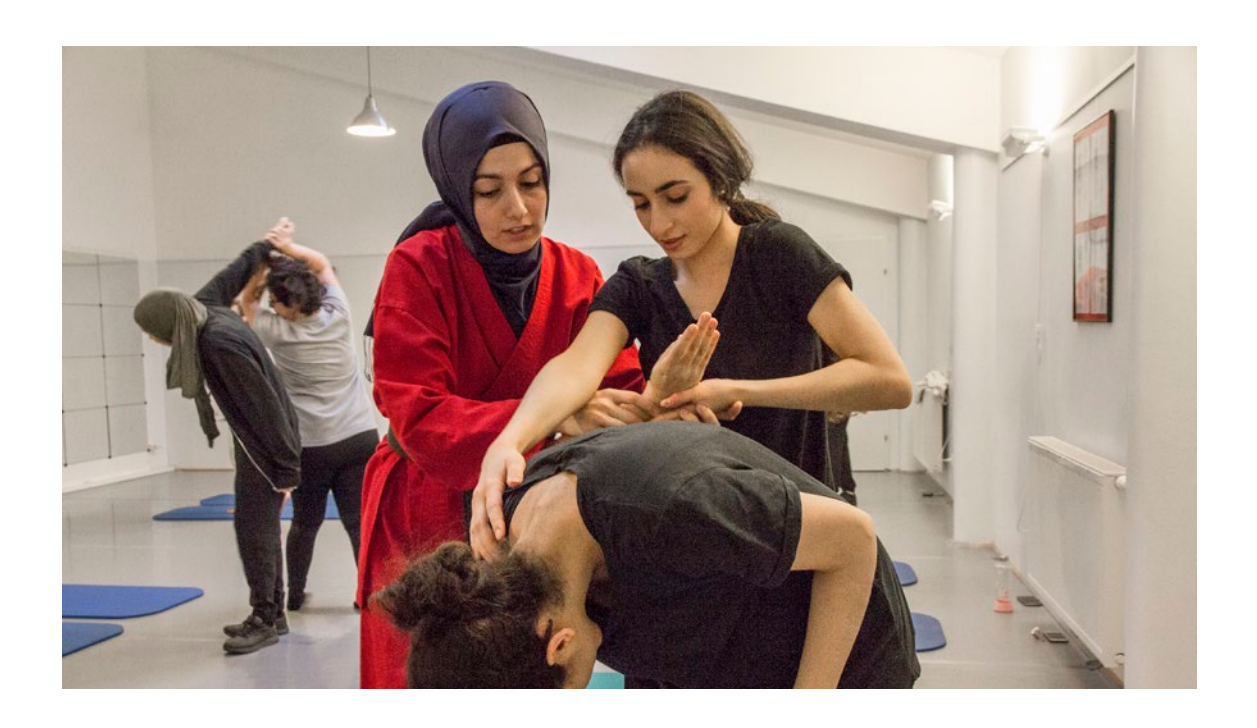
Self-defense course run by Muslim Civil Society Network (NMZ), Vienna